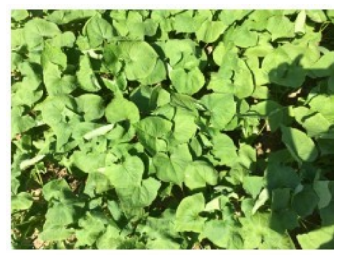
Lifago Buckwheat has larger leaves than VNS

Basagren (bentazon), Command (clomazone), Dual Magnum (S -metalochlor), Eptam (EPTC), Prowl (pendimethalin), Raptor (imazamox), Roundup (glyphosate), Sencor (metribuzin), Treflan (trifluralin)