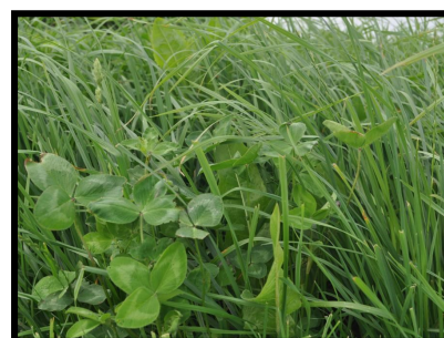
RIGHT: Premium Clover Mix