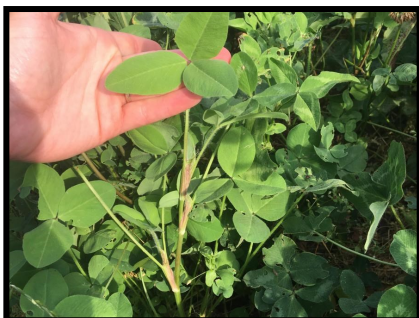
LEFT: Pasture Booster

Orchard Enhancer - A white/ladino clover mix for orchards.